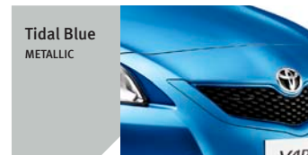
Tidal Blue METALLIC