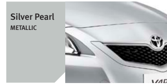
Silver Pearl METALLIC

Thanks to the compact exterior dimensions Yaris sedan has an impressive turning radius of 4.9 metres.