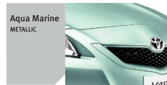
Aqua Marine METALLIC

Access to the spacious sedan interior is easy through the 4 wide-opening doors. Although Yaris sedan is compact outside, the interior space will surprise.