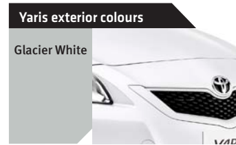
Yaris exterior colours