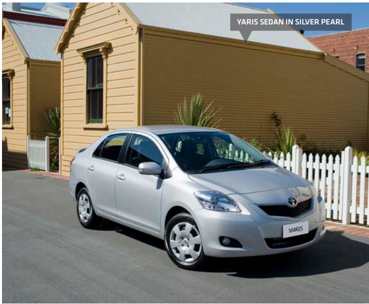
YARIS SEDAN IN SILVER PEARL

The smartly packaged Yaris sedan is a friendly companion in tight city spaces.